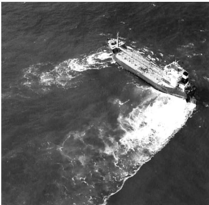
Fig. 3. M/V Esso Plymouth equipped with Single Schilling Rudder provide crabbing ability when used with a bow-thruster (Japan Steering Systems)

The example of propulsion-steering system consist of Schilling Rudder and bow-thruster shows on figure 3 the possibilities of the realization of the transverse movement (crabbing of the vessel).